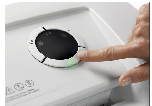
The easy-to-use command dial controls all shredder functions including power up, reverse, and continuous run.