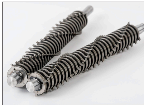
Aggressive cutting edges are fused to a steel shaft, creating an incredible bond and superior performance.